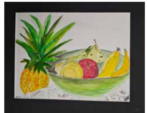
Step Up Hub - 3rd Place Sahar Chowdhury