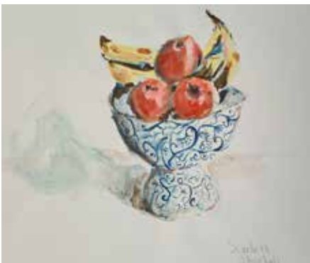
Step Up Hub - 1st Place Scarlett Shortall