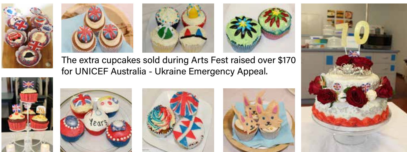
The extra cupcakes sold during Arts Fest raised over $170 for UNICEF Australia - Ukraine Emergency Appeal.