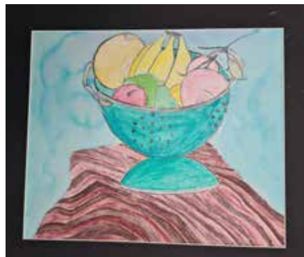
Step Up Hub - 2nd Place Jaxon Tindall